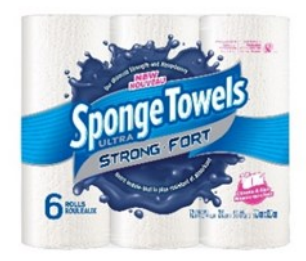
Napkin, paper towel, bathroom tissue, and diaper wrap packaging