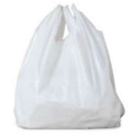
Plastic grocery/shopping bags